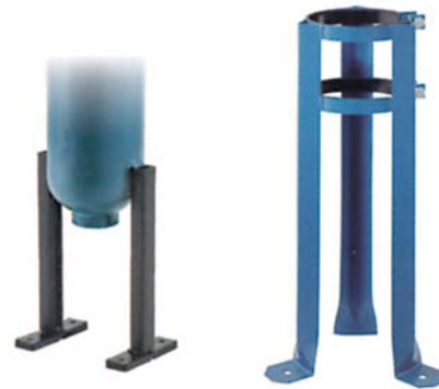
Plastic and Metal Leg Stands