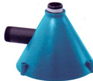
Cone Base Stand

Wastewater Evaporators ■ P. O. Box 1103 ■ Bellingham, MA 02019